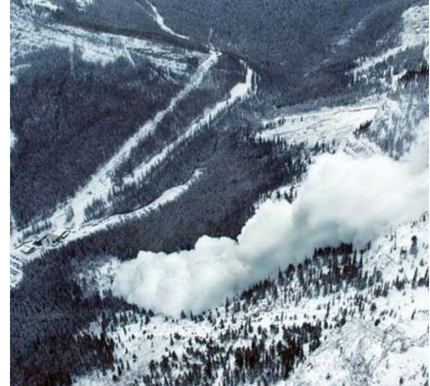
Avalanche over Bourgeau Right-Hand